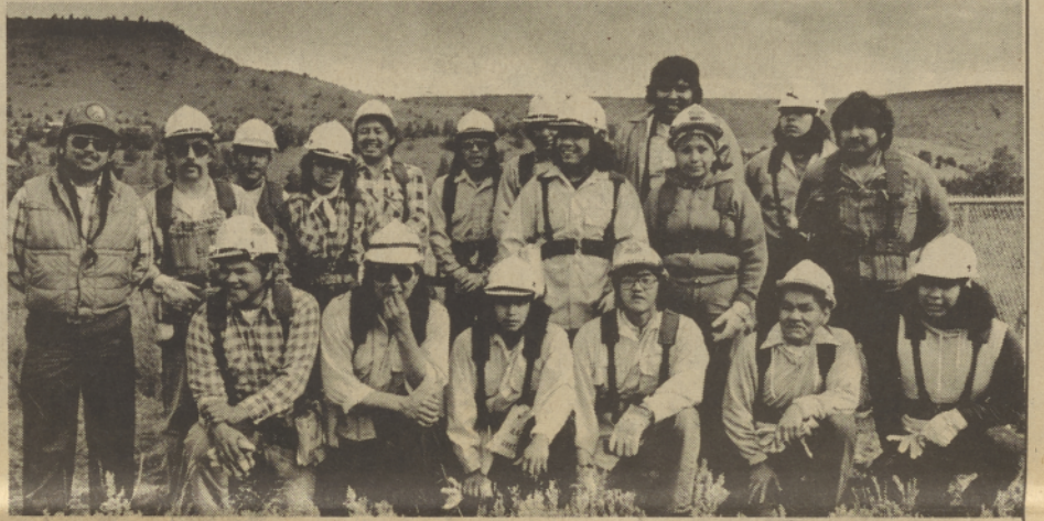
Warm Springs had its own "hot shot" fire fighting crew. The crew was composed of local people. The goal of the crew was to become a well-trained, fast and skilful team. They were used in fires in Oregon.