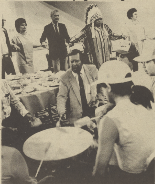
Oregon Senator Mark Hatfield was honored guest at a luncheon held at Kah-Nee-Ta August 20. There was an honor dance and a friendship dance. The Pine Grove Jrs. provided the drumming and singing.