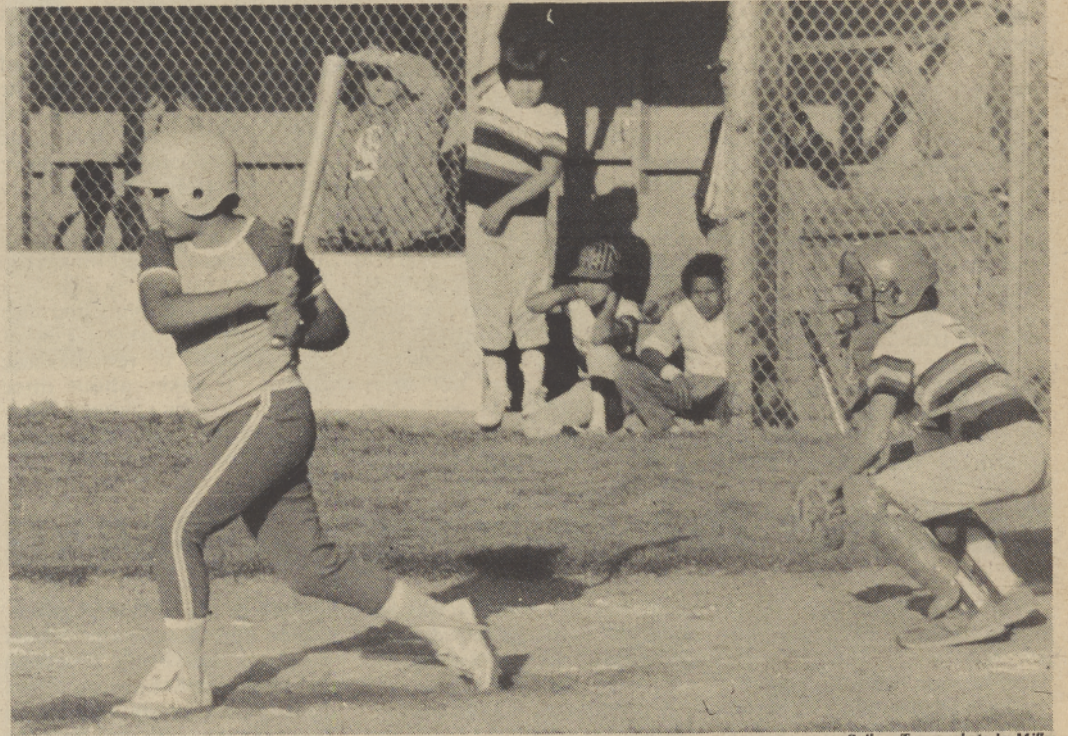
Spilyay Tymoo