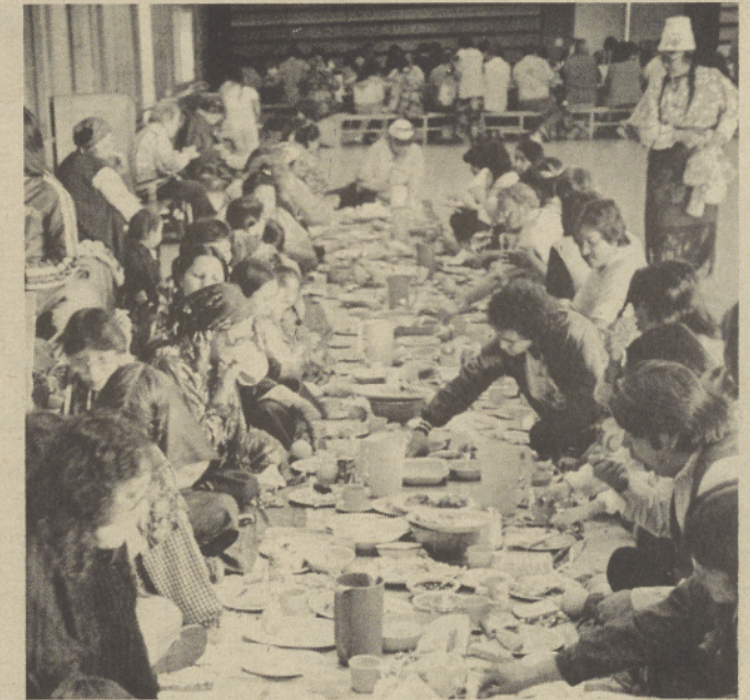
After prayers the people at the Agency Longhouse share the Root Feast meal with friends and guests.