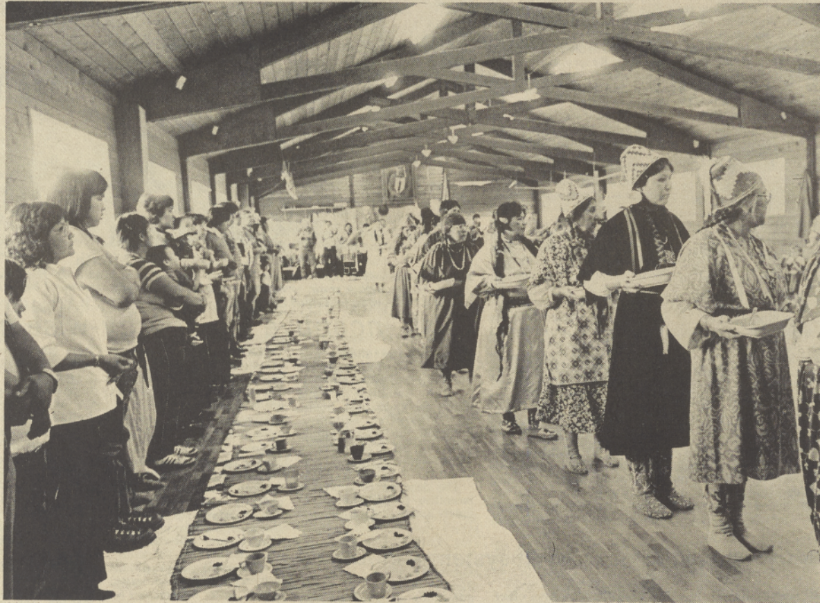
Circling the longhouse food preparers and servers place the bounty of food on Tule mats set up for eating.