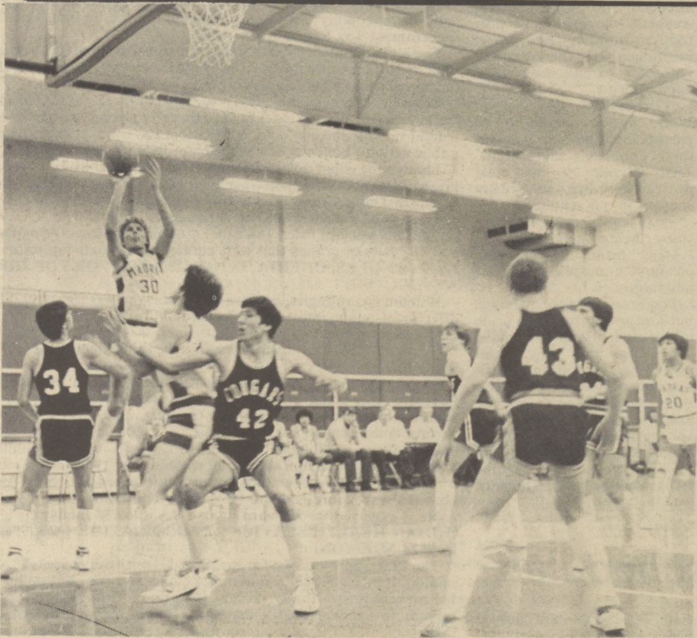
The Madras White Buffaloes charge past the Cougars of Mt. View of Bend, in a non-league basketball game on the Madras home court on January 3. The Buffs now boast a 6-2 record so far before league play starts later on this month.