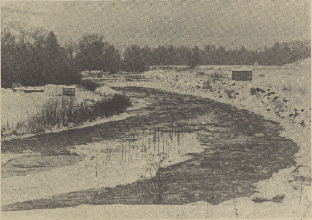
Signs of freezing

Well, this area had a "White Christmas" and a "Winter Wonderland." Ever wonder what's in store for this month?