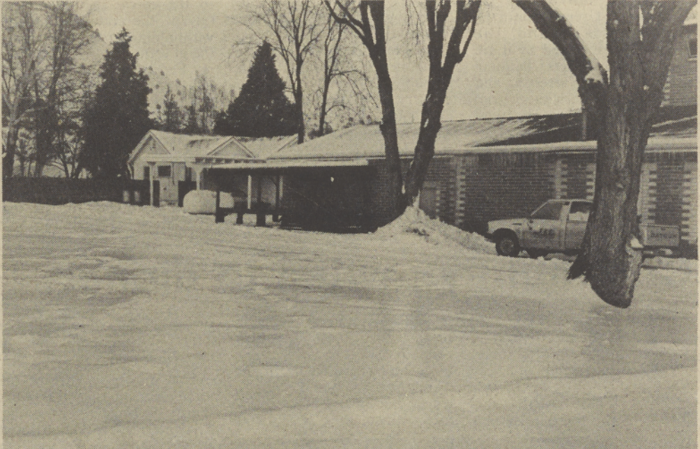
Sea of Ice