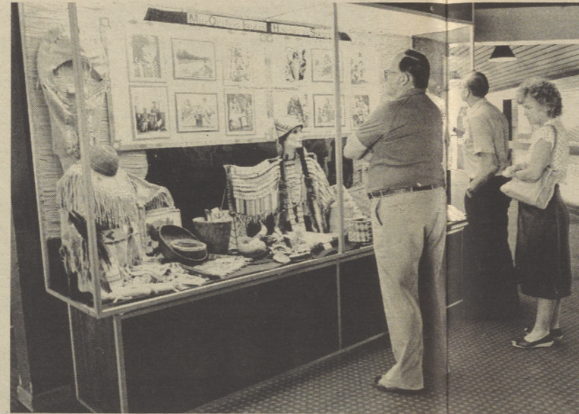
The artifact display case Kah-Nee-Ta draws many visitors. The items displayed are from the MOIHS collection.

By the time visitors reach the museum/cultural center, they have passed through the vastness and beauty of much of the reservation.