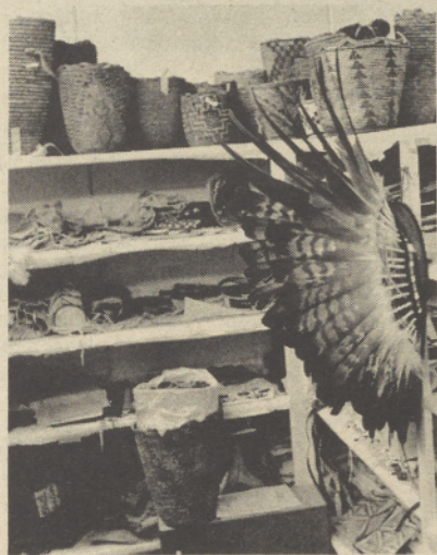
Over 1,600 items have been gathered for the pending museum/cultural center.

—Utilizing wayside (outdoor) exhibits, story boards, audio visual techniques and other media forms to achieve the desired results.