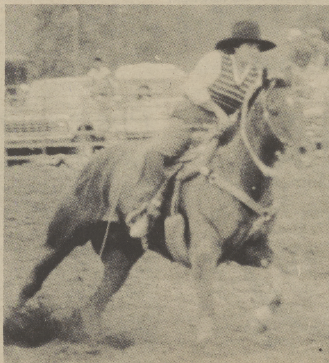
Spilyay Tymoo photo by Miller