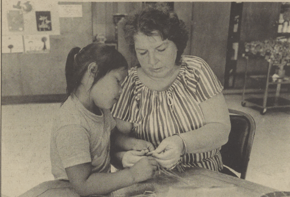
Spilyay Tymoo photo by Shewczyk