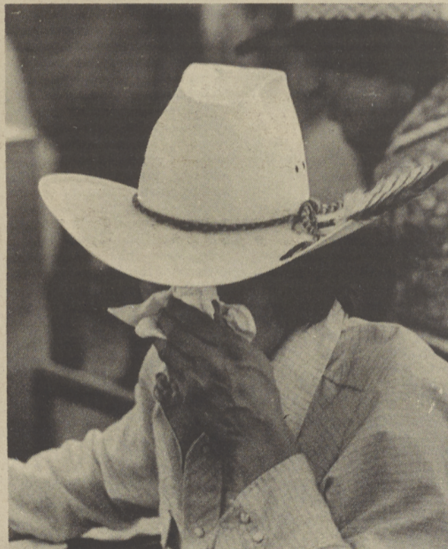
Spilyay Tymoo photo by Shewczyk

The weather was favorable as there were no real threats of rain during either performance. See rodeo results in lower right corner of this page.