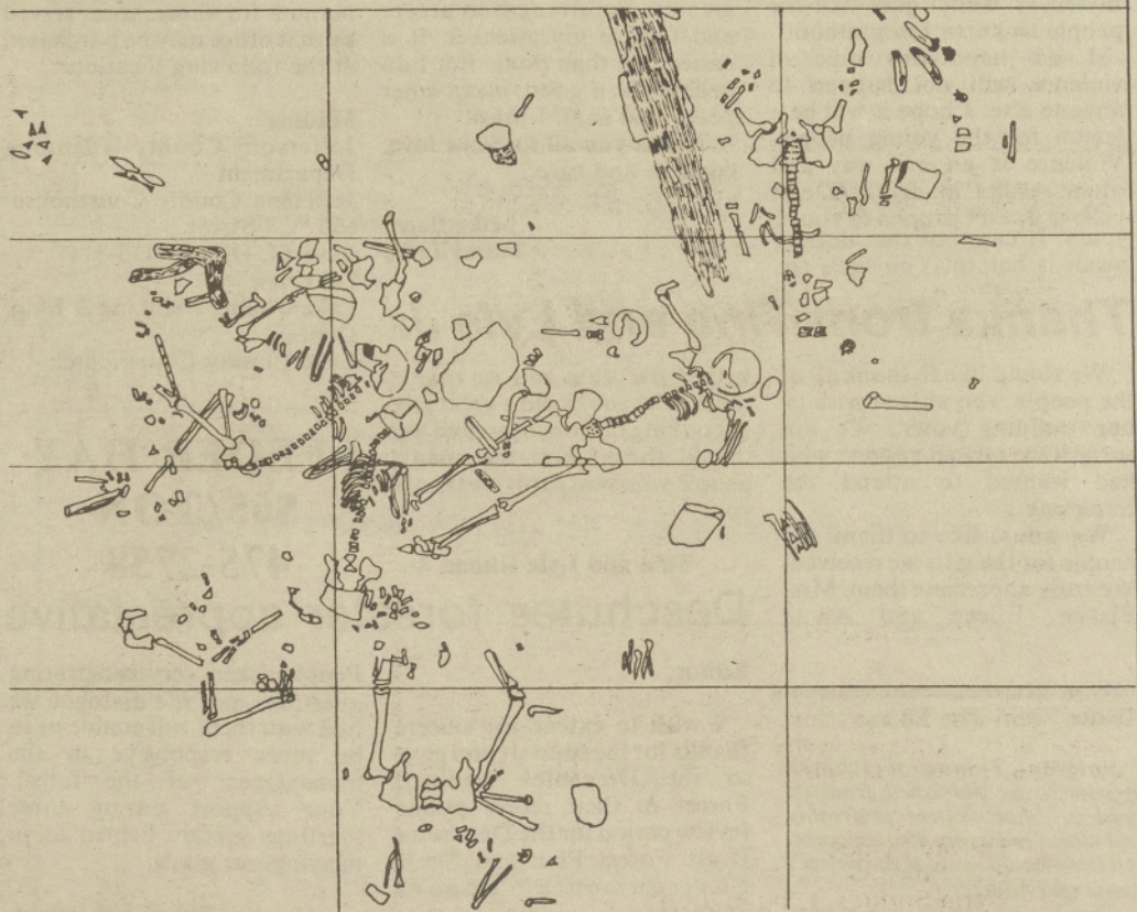
A sketch of the site and the way the remains and artifacts were found.