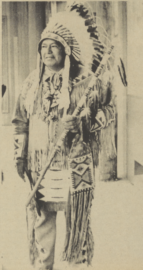
Outfit that was stolen from Chief

Weapons should be registered at the police station. The department is there for the people and the police have suggested for people to protect their belongings. If you are going to be away from your home for any period of time you can let the department know how long you will be gone, if anyone should be at your house, and other vital information. The department will make periodic checks of your house while you are away. When you are going to be gone make sure your house and buildings are secure. Lock your doors and secure your windows. If you need any help or suggestions call the police department and they can assist you.