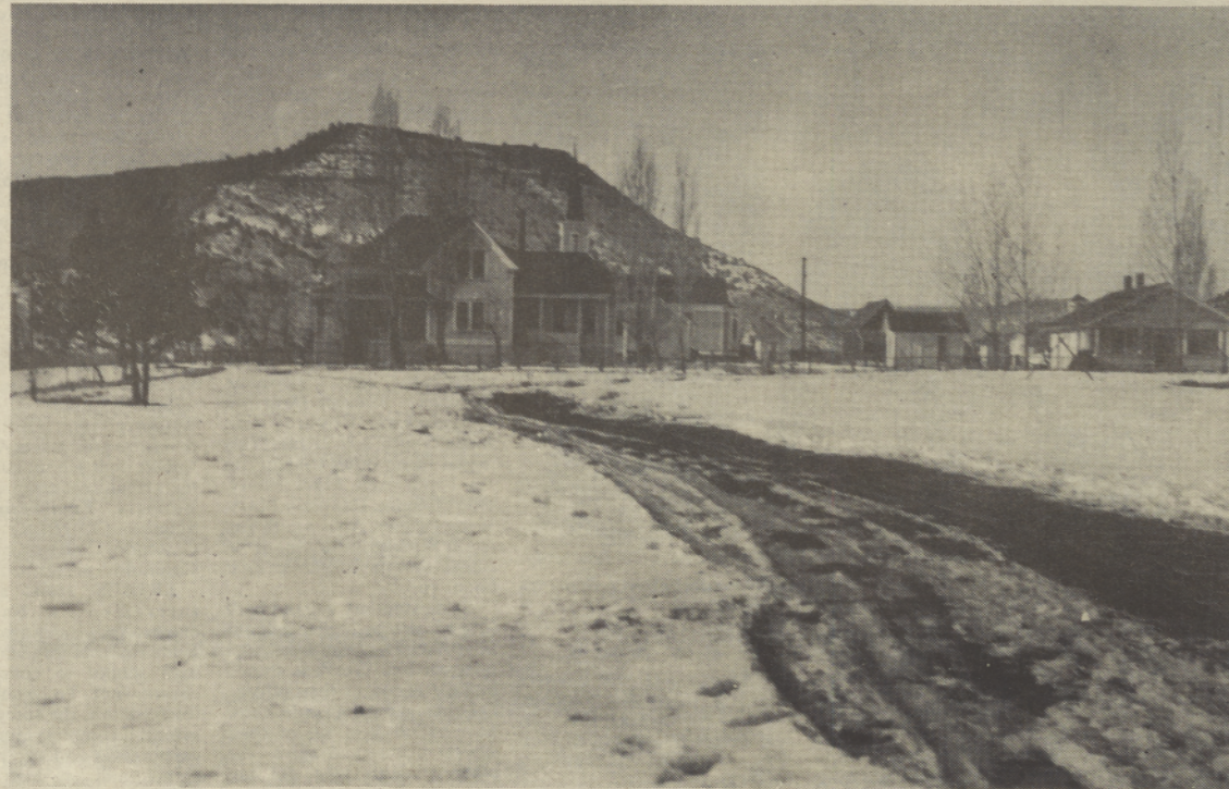
Warm Springs Agency in the 1920s. The mess hall is in the center.