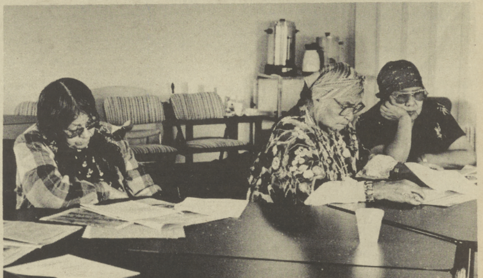
The draft of the comprehensive plan was reviewed recently by senior citizens. The plan provides guidelines for the future use of the reservation. Community members are welcome to attend meetings of the plan's discussion scheduled through February.