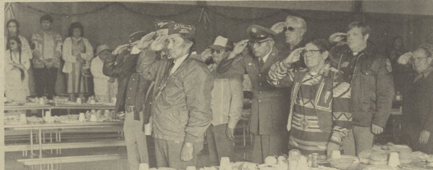
A salute to the flag opened Veteran's Day ceremonies at the Agency Longhouse