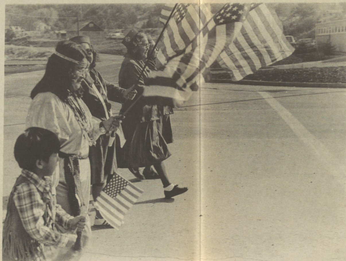
Flag bearers proudly march in unison carrying the red, white and blue.