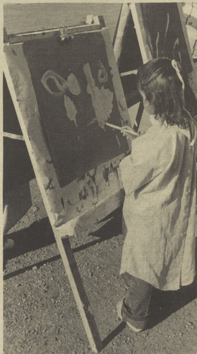
Catching the best of the light A Headstart artist made use of the morning light on a warm autumn day to create a work of art.

Parents, I would like to remind you about becoming involved with your children as much as possible with their education. It shows concern and caring, especially for those students who may be entering "Alternative Education." After the quarter, more students may be placed into Alternative Education due to lack of attendance, short credits, and health. Parents must know what Alternative Education is and how it will benefit their son or daughter. Much encouragement is needed for the Indian youth to keep going and to "hang in there" no matter how difficult it may seem. When a parent is involved, the road to a diploma may not be as difficult as it appears.