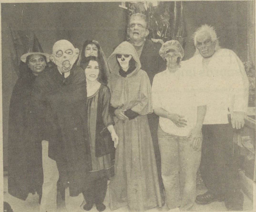
Entourage of ghouls inhabited Warm Springs on Halloween.