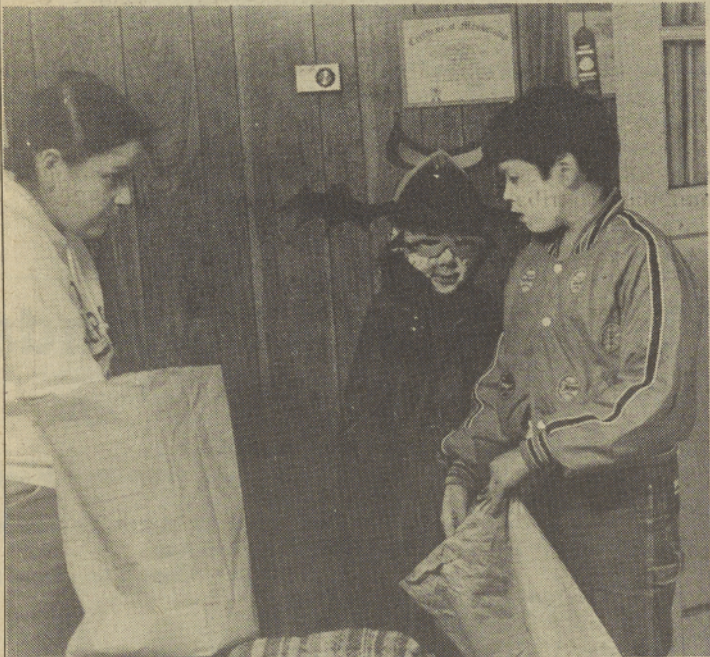
Trick or treat, give me something good to eat.

Cold chilling winds whipped through the moonlit streets on Halloween but miniature ghouls, monsters, clowns and Extra Terrestrial travelers braved the weather for the yearly trek to "trick or treat" for candy and other goodies.