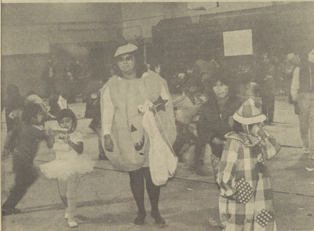
Annual Halloween carnival drew "fun bunch" to the Center.

The streets are quiet now and the tiny costumed creatures of Halloween have passed through the event in safety. It was a Happy Halloween for all.