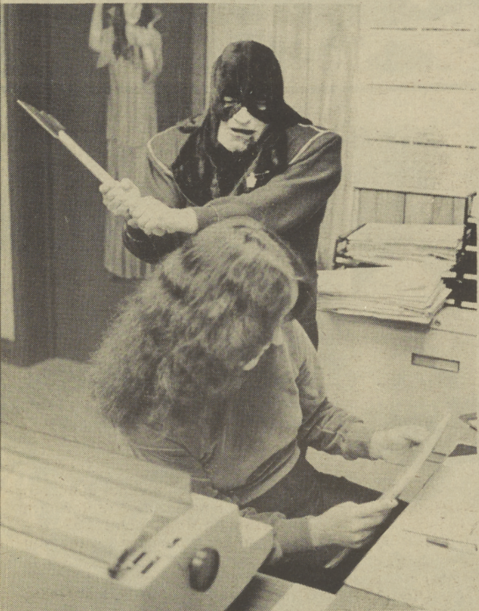
The Executioner wielded a bloody ax at fellow employees.