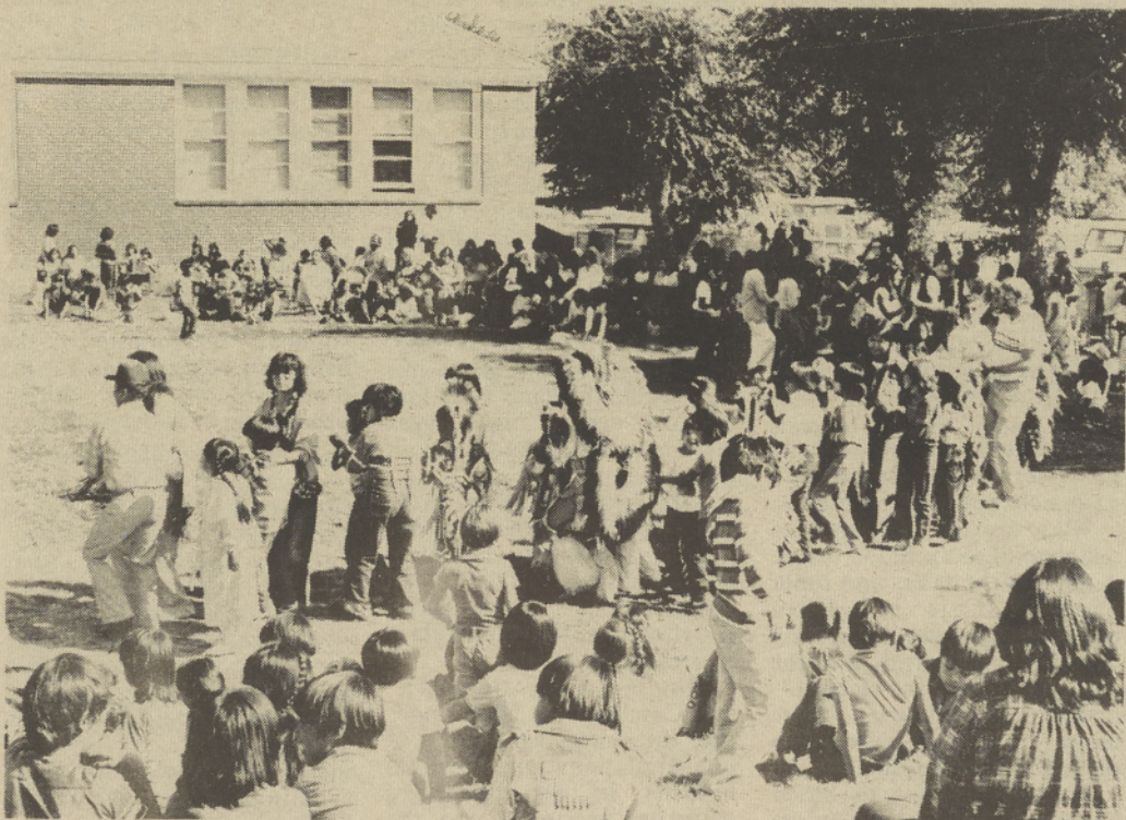
The school powwow held on October 1, 1982, after their first student assembly drew a good crowd of parents and friends. Parents and faculty joined right in with the children in all of the dances. Everyone had a good time.

There was the traditional men's war dance put on by the boys and girls traditional dance. The kids even put out some fancy dancing for the parents and spectators. The faculty also joined in with the kids since this was a powwow for all.