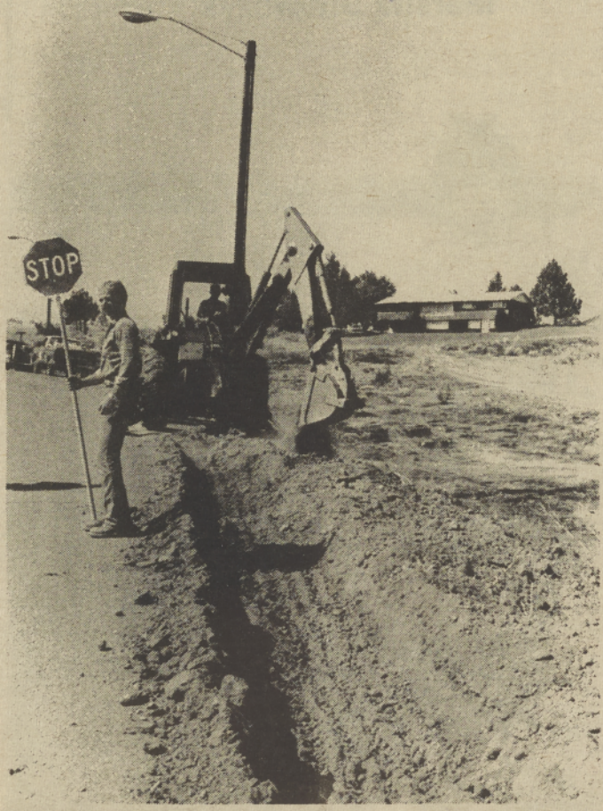
TEARING UP THE ROAD—Work crews direct traffic, dig trenches and reroute cable on West Hills Drive as the road is prepared for the gravel and sealer coat.

The roads department will notify West Hills residents when their street will be worked on, the roads will be closed to traffic at the time the sealer coats and gravel are added. Each street will take at least a day and to insure a good sealer coat, it will be necessary for people to avoid traveling on the street. It has been suggested by Souers that residents park their cars on another street so they will have access to their car without disturbing the road repair. Your help will be appreciated.