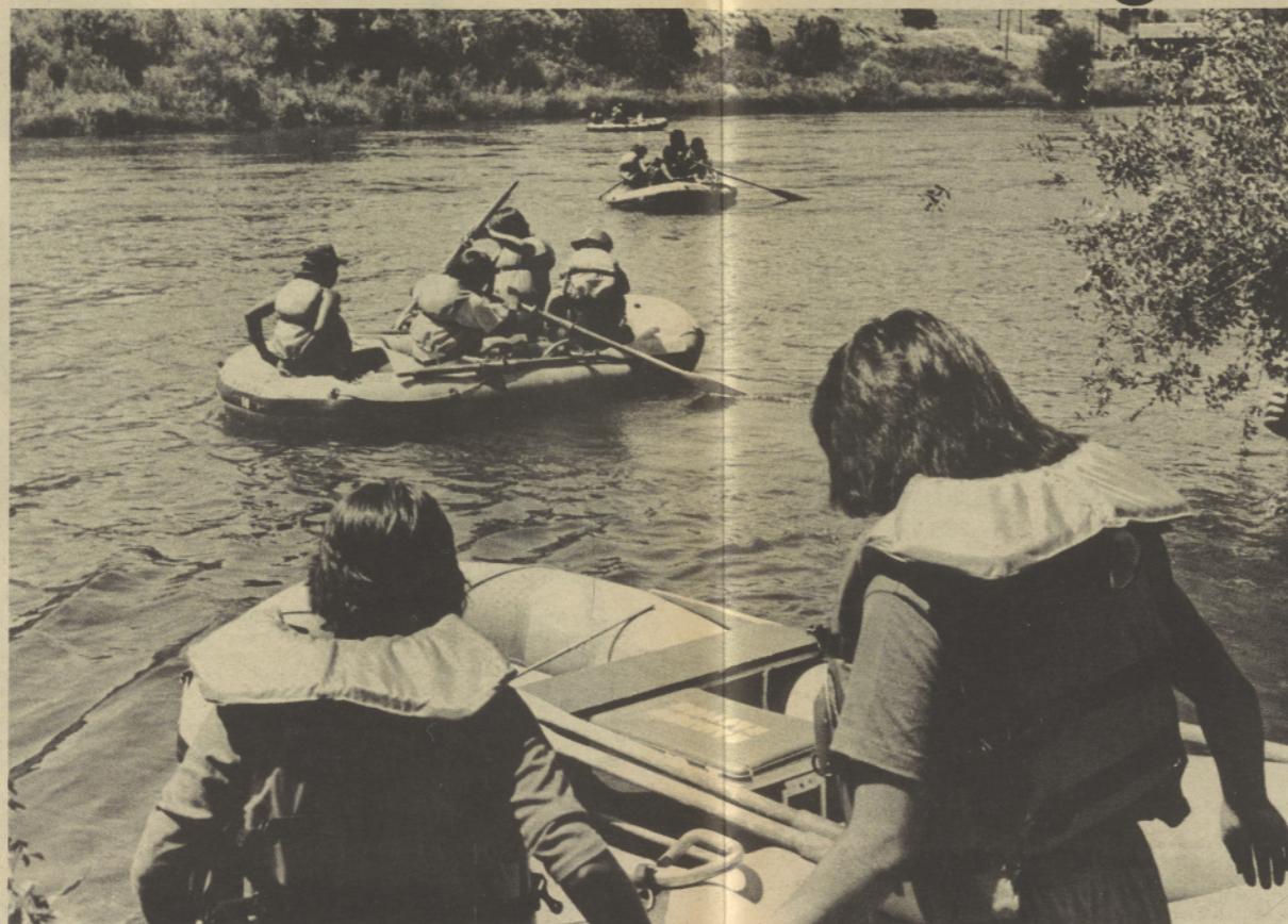
WHITE WATER SPORT —For some of the recreation participants an afternoon spent on the Deschutes River is the ideal way to spend a summer's afternoon.