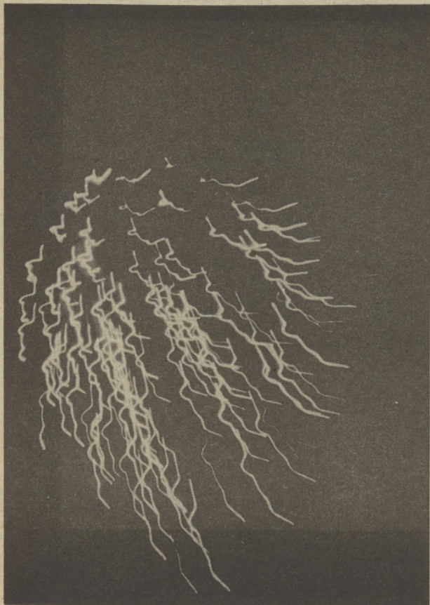
SHOWERS OF FIREWORKS —Bursts of bright lights filled the sky and thrilled the crowds during the annual July Fourth celebration.