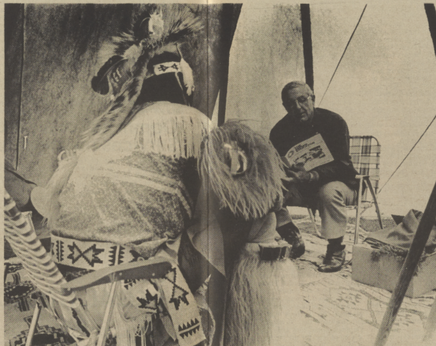
Governor Atiyeh set up shop in a tepee for people to talk with him about issues concerning Indians.