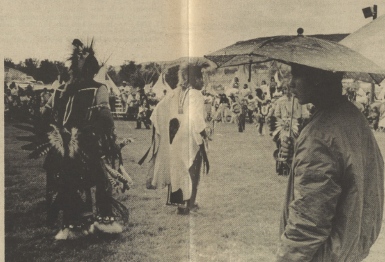
For the first time in years, Pi-Ume-Sha was deluged with heavy rain. Umbrellas popped up as the rain came down—usually umbrellas are used to keep off the sun.