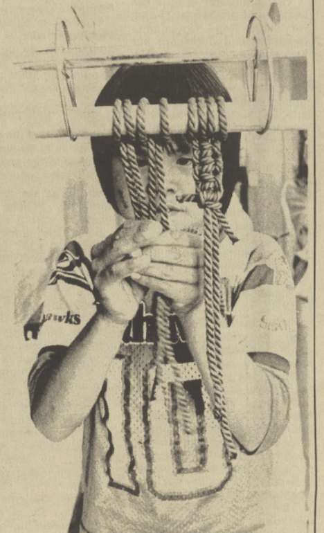
Knot tying also known as macrame is a practical skill and can at the same time be a means of expressing creativity. It looks confusing to begin with but once you get the hang of it, knot tying is easy.