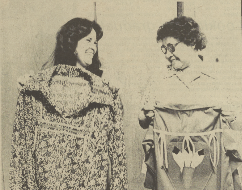
Completed ribbon shirts is the result of one COCC class offered in Warm Springs.

Warm Springs has always been very supportive of community education. Once again its existence in Warm Springs is dependent upon passage of the COCC budget levy on May 18. It is necessary that community members get out to vote.