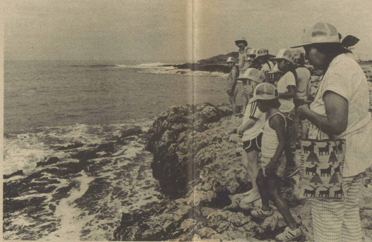
Unlike Oregon, the ocean water around the Hawaiian islands is an aqua-marine color and very warm. Simnasho visitors were warned of being too adventurous in the tides.