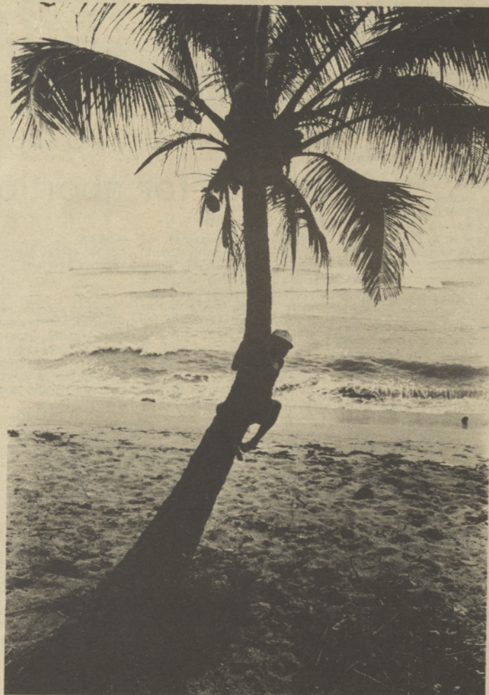
Trees to climb in are a little different on the island of Oahu than they are in Warm Springs. Joshua Currey tries it out.