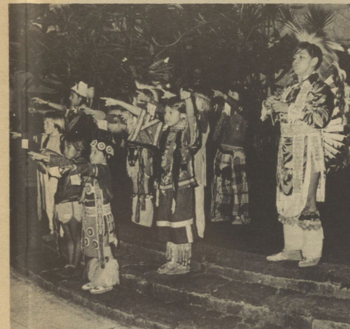
The first performance by Simnasho students took place at the Ilikai Hotel in Honolulu. They were well received.