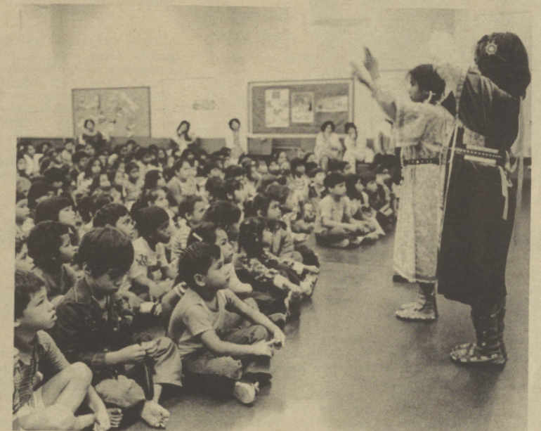
Young Hawaiian students at Blanche Pope Elementary School were awed at having Indian students performing for them. It was a new experience for them, as well as for the Simnasho students.