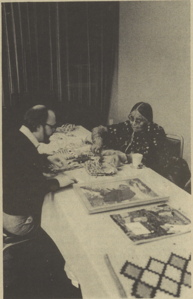
ARTIFACTS PHOTOGRAPHED —Tribal members brought family heirlooms and artifacts to Kah-Nee-Ta for a field day yesterday. The field day was organized cooperatively by the Culture and Heritage Committee and Rocky/Marsh Public Relations in order to catalogue items for an upcoming book.