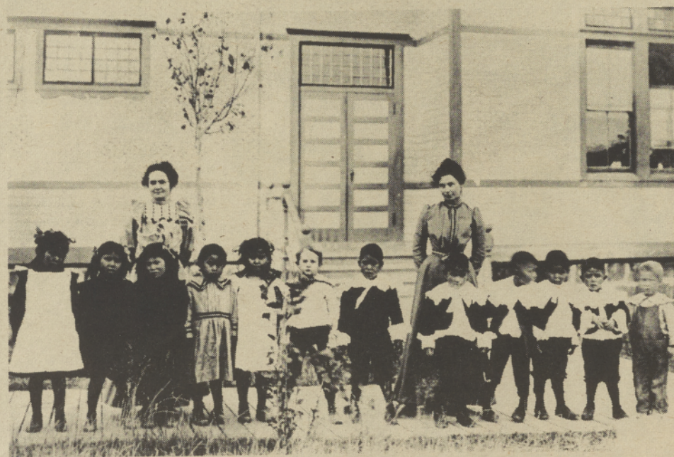
Class of '95 in new regulation uniforms