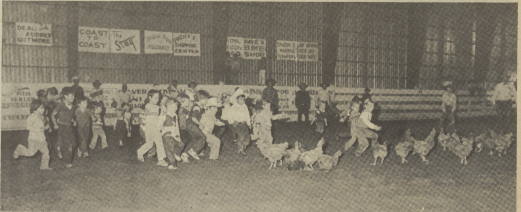
CHICKEN ON THE RUN —The chicken scramble for three to five year olds concluded Cowdeo events. Many parents were not aware until their child had a chicken in hand that those children that caught a chicken got to take it home.