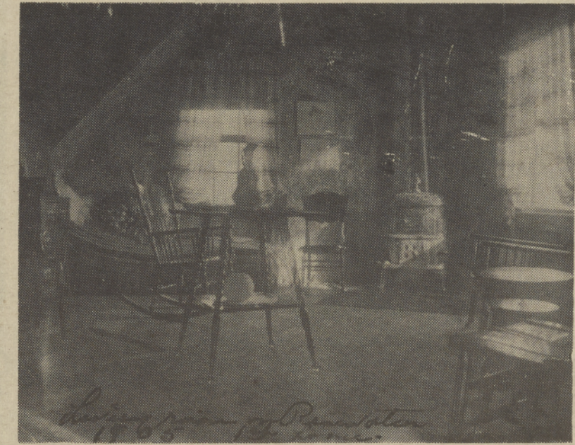
A cozy parlor-1905