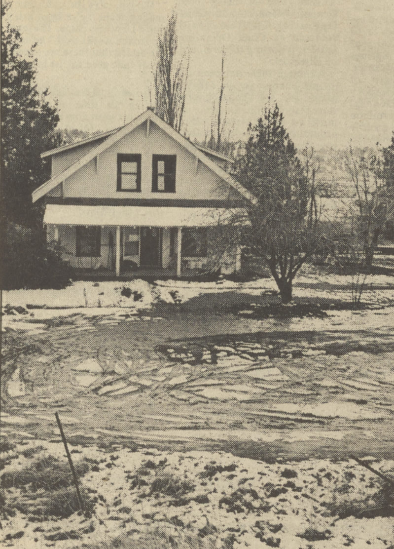
Standing stately just before the end

The sounds of living echo through the walls of any house. But a very old house has absorbed, through time, the vibrations of many people and many times. The walls have become a storehouse of words and memories. "If only the walls could talk," says Faye Waheneka.