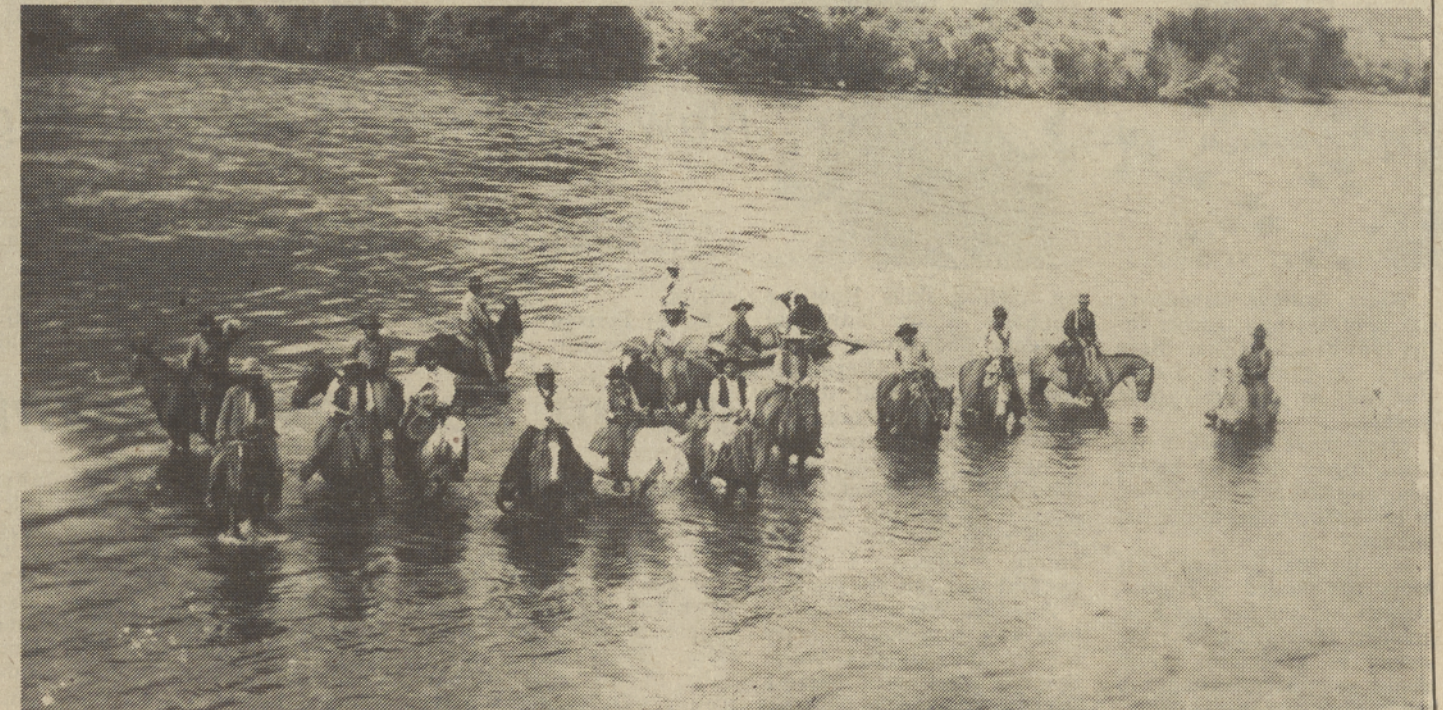
Some people didn't bother using either the ferry or the bridge when crossing the river to arrive at Mecca Trading Company. This was a familiar site from the residence next to the store.