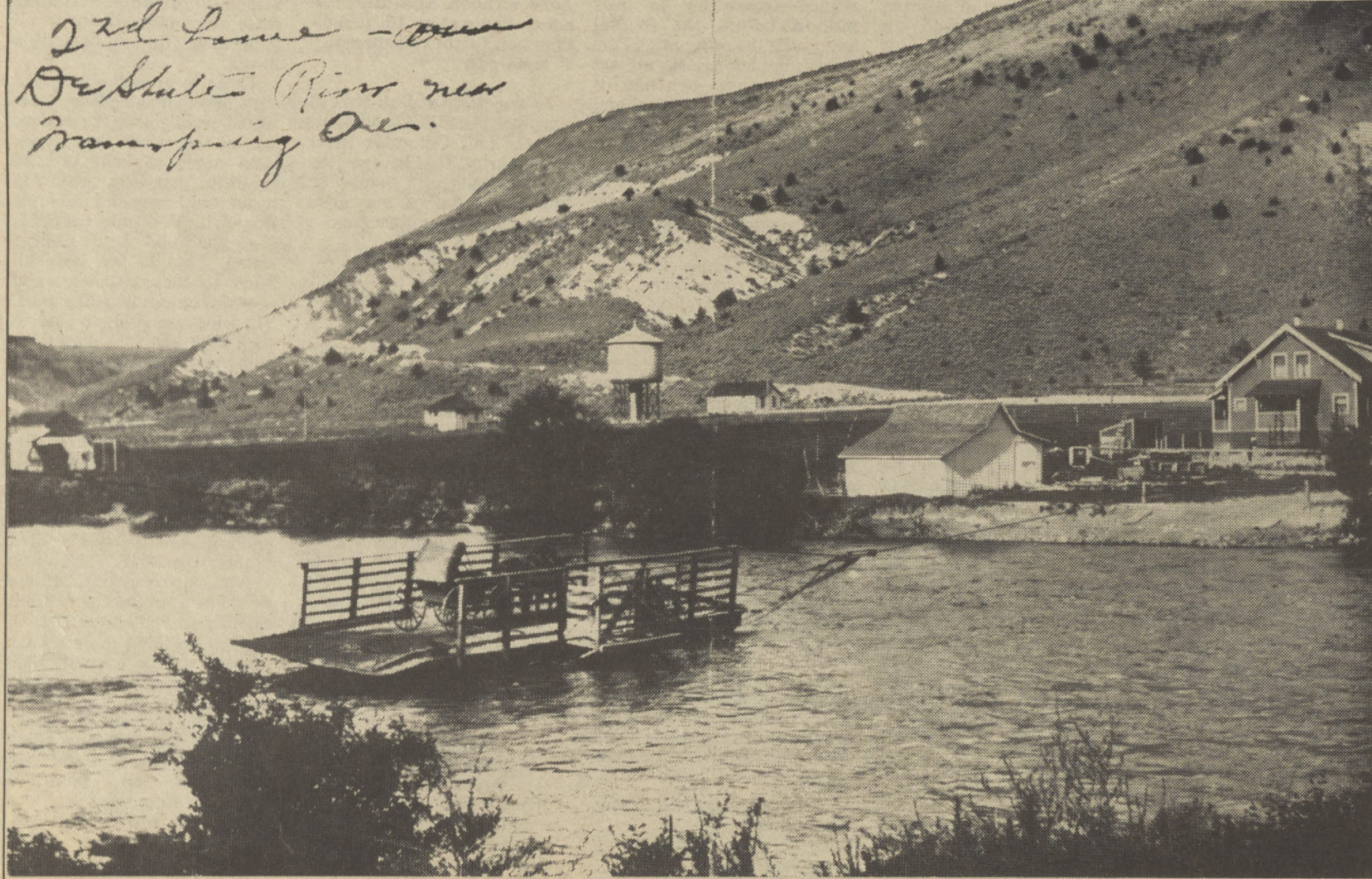
At one time, the ferry was the only means of crossing the Deschutes river at Mecca. The now demolished house stands sturdy here.

2nd Lane - over Deschutes River near Warm Springs Ore.