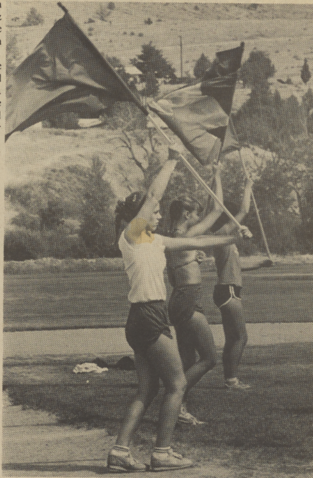
Every field at the Community Center was occupied for three days as Sunset High School band and color guard students put all their efforts into learning their routines. The group from Beaverton, Oregon is practicing for games and competition. The camp is being held in Warm Springs to keep student's minds on just their routines, according to one instructor.

pm. Saturday, September 26 a double point ABA sanctioned race will be held. Registration for Saturday's race begins at 3:00 pm. The race begins at 4:30 pm.