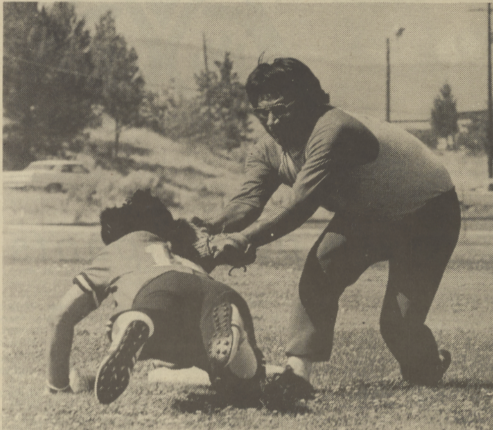
Crawling Back —A Warm Springs Tribe player failed to get back to third base before an out was called on him. Despite the outs the Warm Springs Tribe team came in third during the Community Center sponsored slow pitch tournament held on August 15 and 16 in Warm Springs.

Results of the tournament are: 1st-Pendleton; 2nd Satus, The Boys; 3rd-Warm Springs Tibe; 4th-Yakima Nation; 5th-Warm Springs Chiefs.