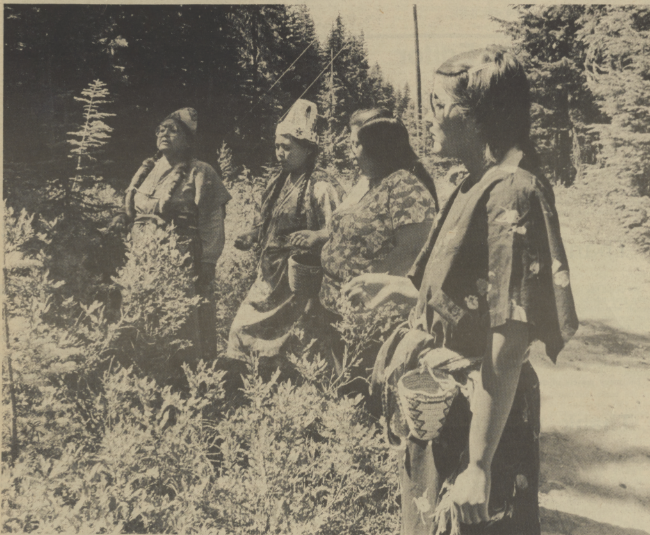
Religious ceremonies begin long before the day of Huckleberry Feast. Women who pick the fruit prepare themselves by fasting and prayer. Young people accompany the elders learning the songs and the true meaning of Huckleberry Feast. These ladies performed the services commencing picking the Huckleberries near Government Camp.