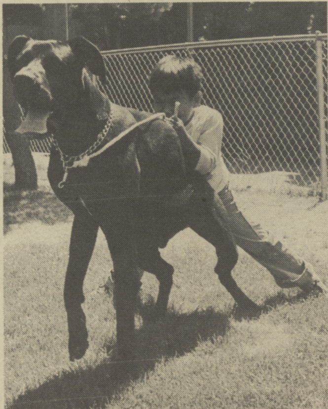
Boy Obedience Training—When a dog this size says go a boy can only follow. The Community Center dog show brought dogs of all sizes together along with providing an entertaining afternoon for the audience.