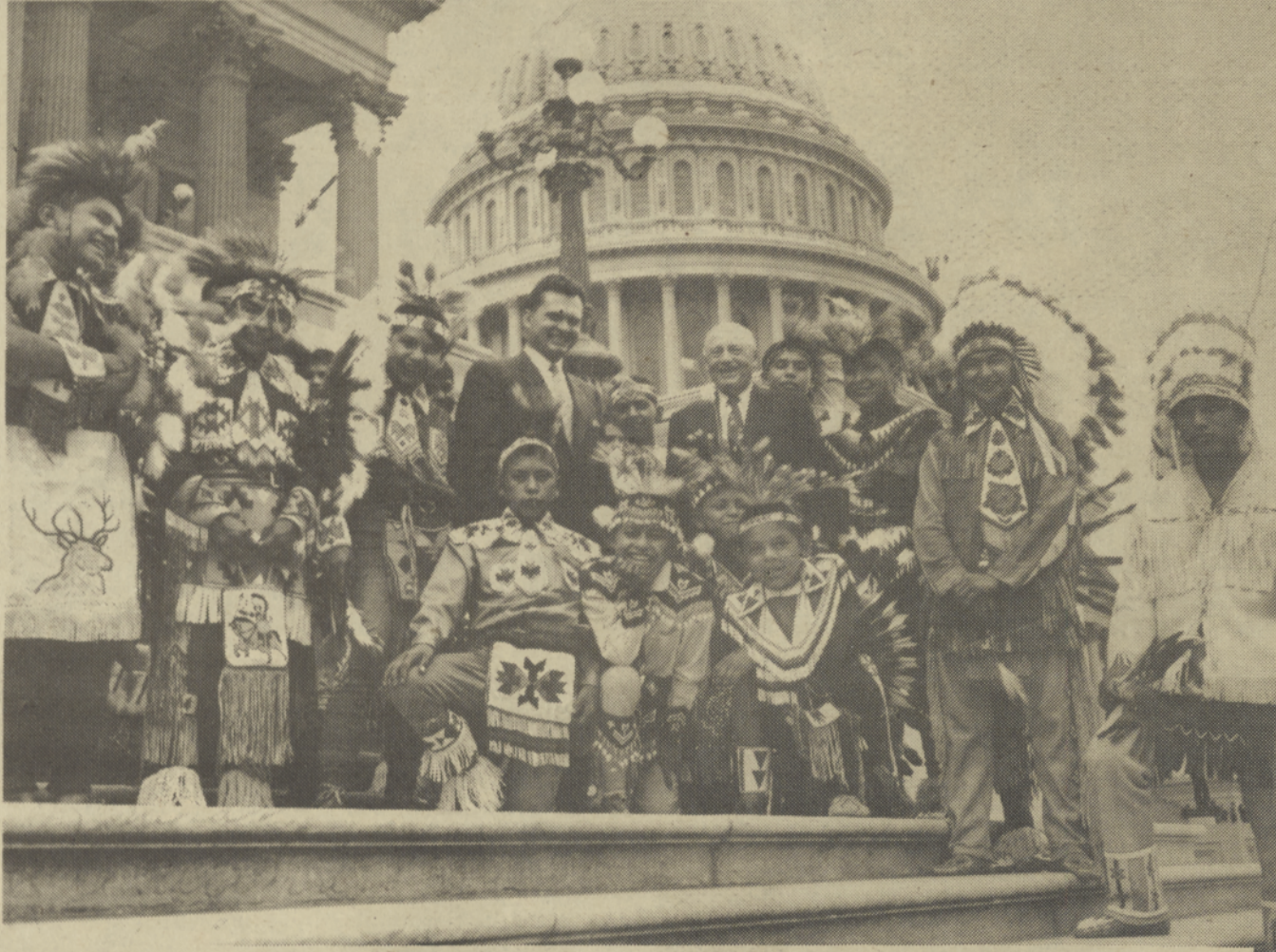
Troop 59 in summer of 1957 stopped by nation's capitol to visit with Al Ullman during their trip to BSA National Jamboree at Valley Forge.

Boys with dreams to build and skills to acquire the answers may well be waiting for you in the scout program. Good leaders are important.