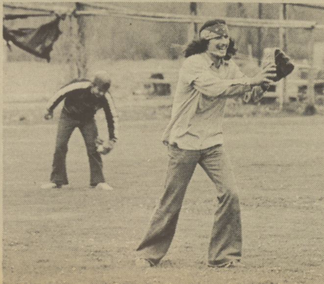
The Warm Springs Forest Products Industries baseball team busily brushes up on their techniques before their opening game of the season. Their first game will be played on May 2 against Rufus at Rufus.