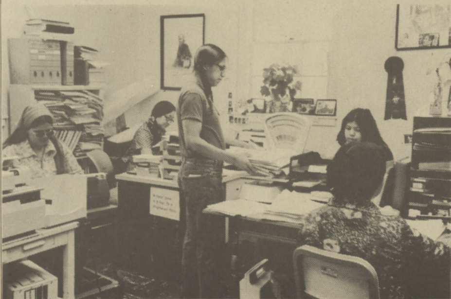
Stuffed Steno Pool —The steno pool office was a typical example of the overcrowded conditions in the Administration Building in 1976. Just such cramped quarters prompted the construction of the new 26,000 square foot administration building located below West Hills.

1976 was a year of firsts for Warm Springs. Spilyay Tymoo was, and still is, the tribe's first newspaper. Many things happened to supply adequate news for coverage.