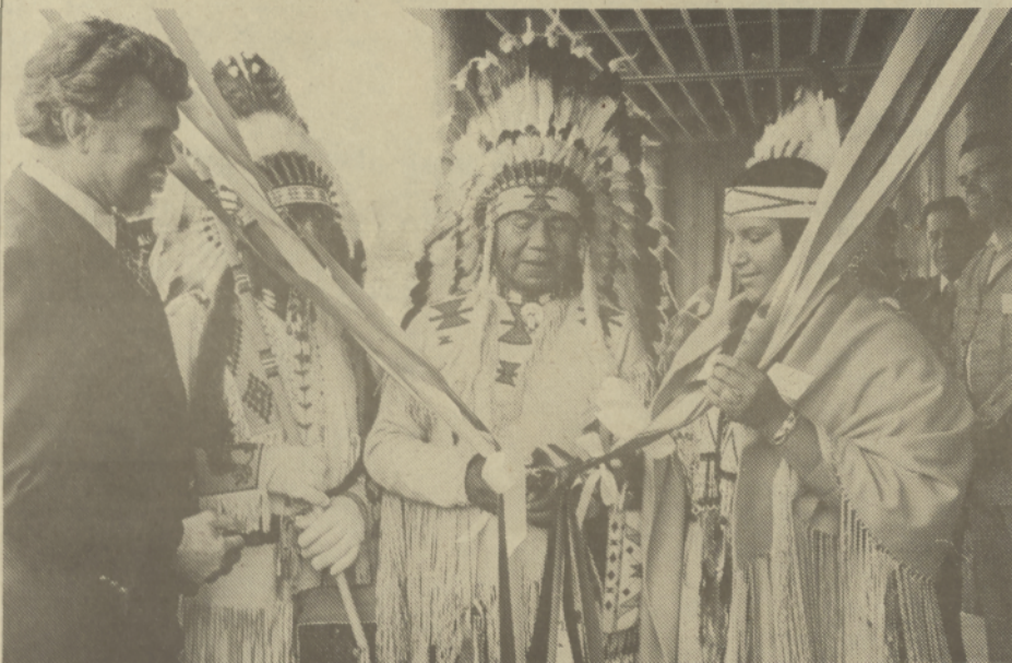
Lodge Addition Dedication — Dignitaries, tribal members and many others attended the dedication in June 1976 of the new 55-room wing at Kah-Nee-Ta lodge. The dedication came on the 12th anniversary of the resort which opened with the village in 1964.