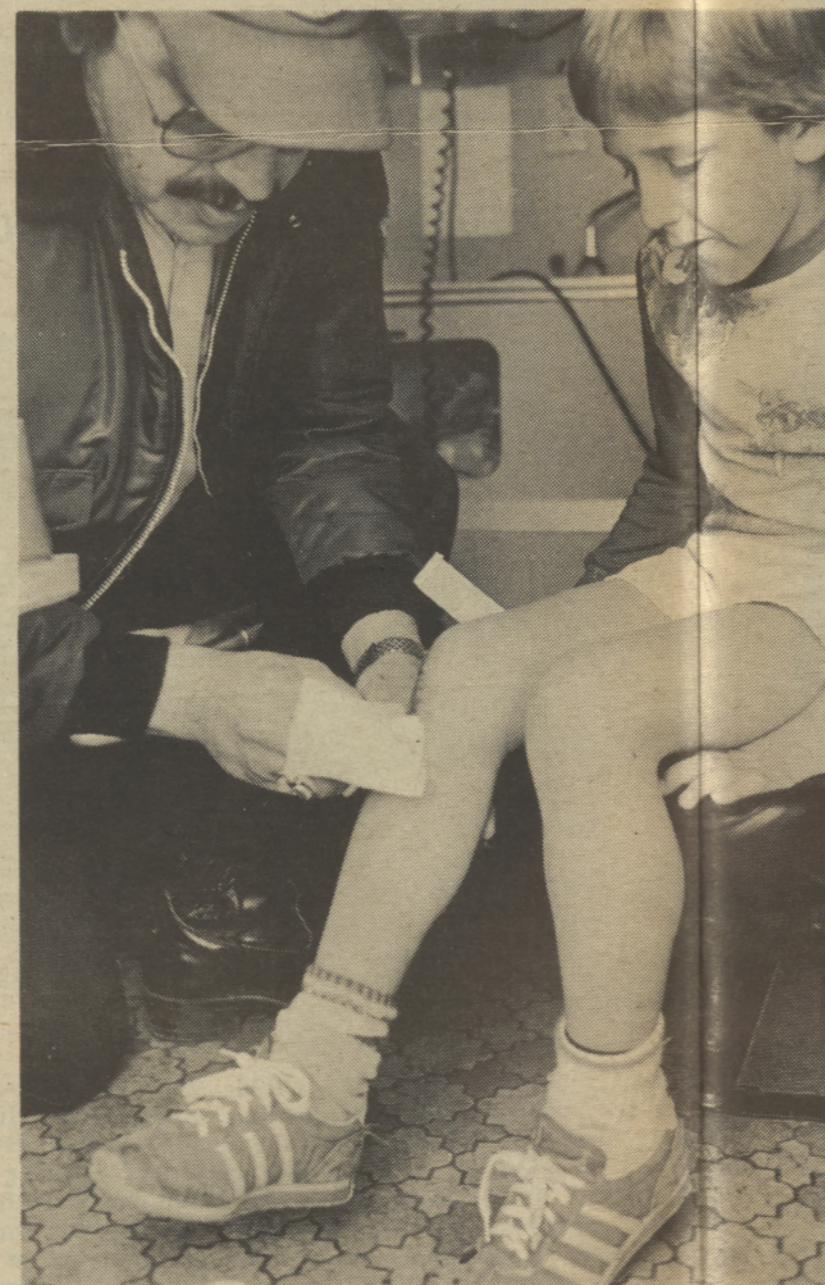
Hazards of the sport