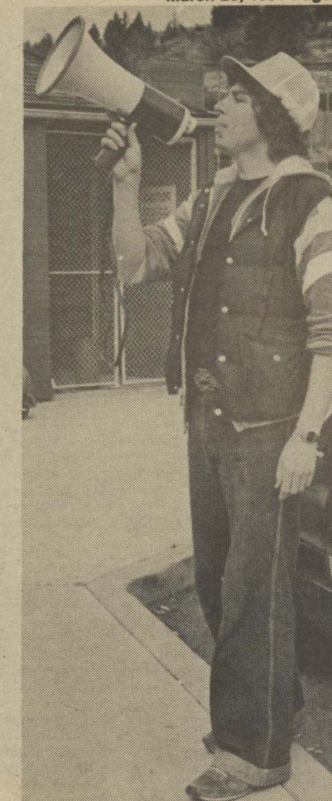
Buses are loading