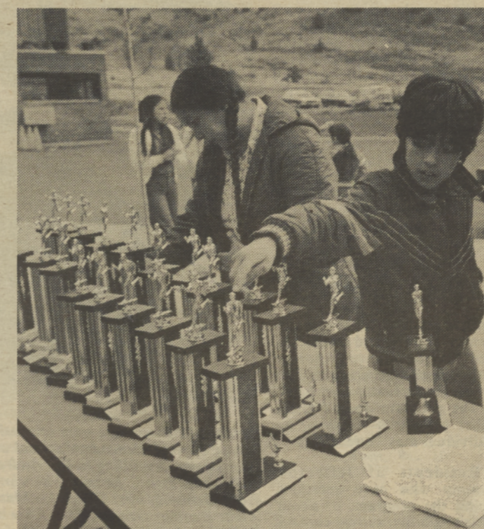
To the winners go the trophies

Some folks ran for the sport of it, some ran for the competition, and others ran to test themselves. Each of the 225 runners started out with the intention of finishing. Some did, some didn't. One runner in the 14.5 mile run commented, "The first ten miles were easy." Those people who ran — whether it be in the 3-mile, the 6-mile or the 14.5 mile run should be commended just for running.