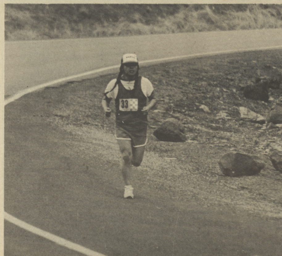
The finish is just around the bend