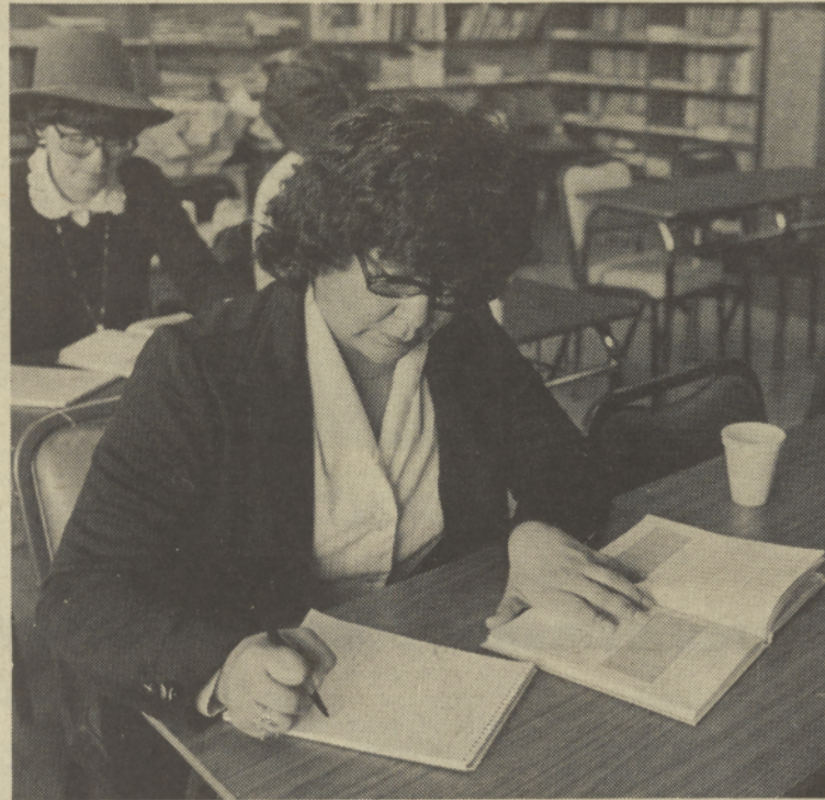
Shorthand makes your day at work a little simpler

Learning is growing— A chance to stretch— and it's fun.