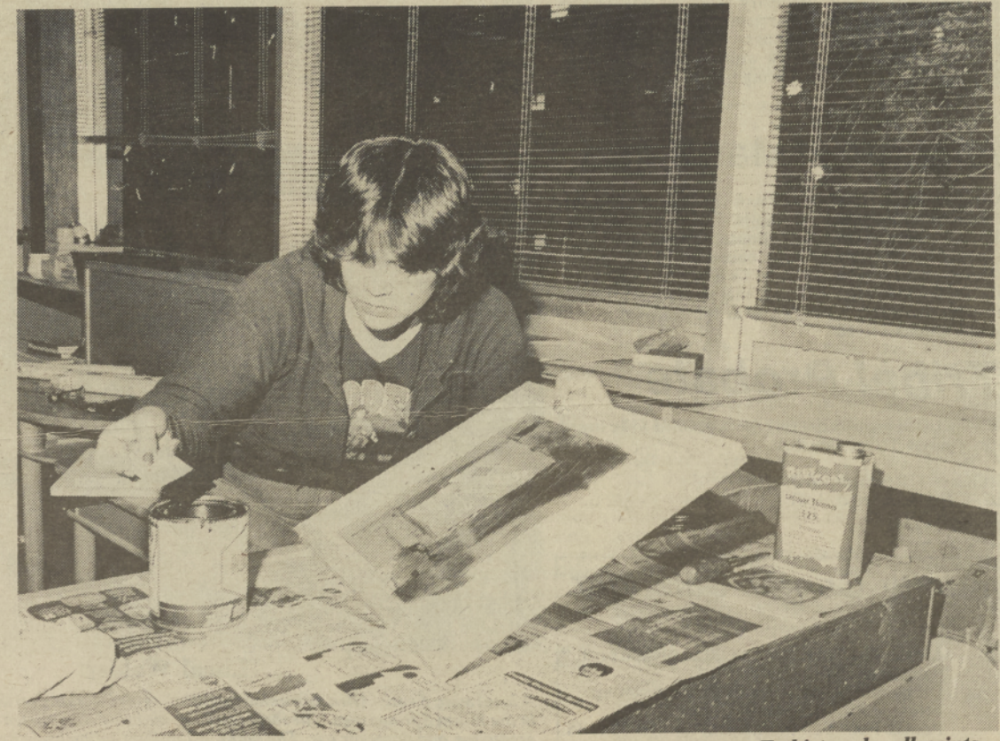
The silk-screen transfer method can be used to design your own stationery, T-shirt and wall prints.