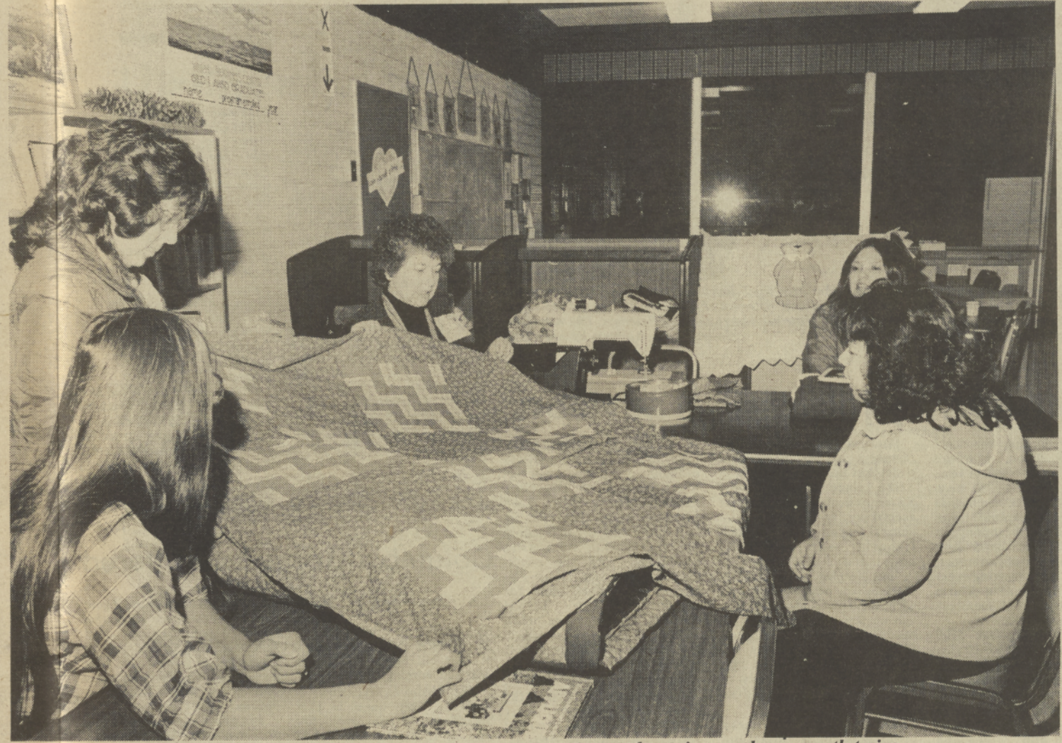
Creating a quilt for cold winter nights and to beautify your home is an endeavor worth trying.