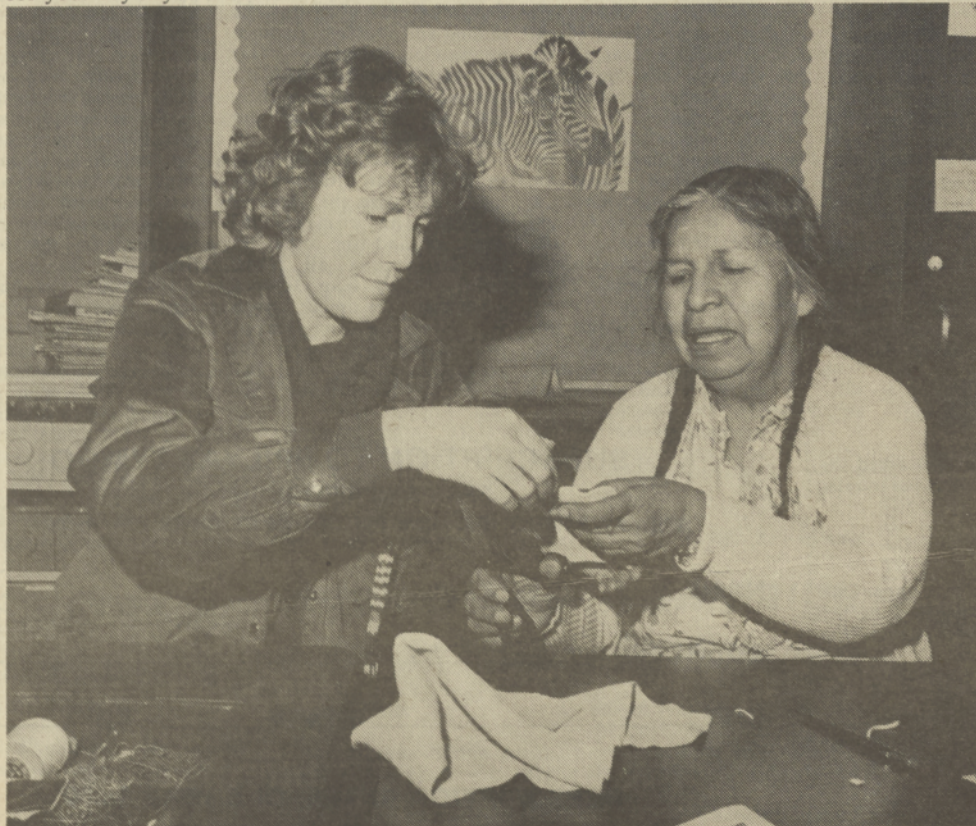
Learning traditional skills such as beadwork requires a teacher who knows all the shortcuts.