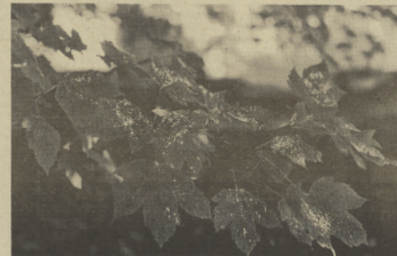
We got a light dusting of St. Helen's ash in September.