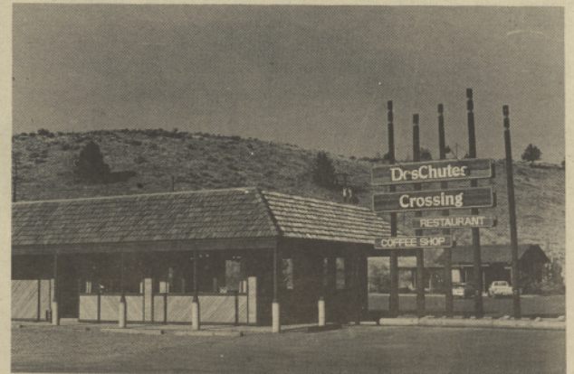
A new eatery, Deschutes Crossing, opened, giving us another place to pig out.