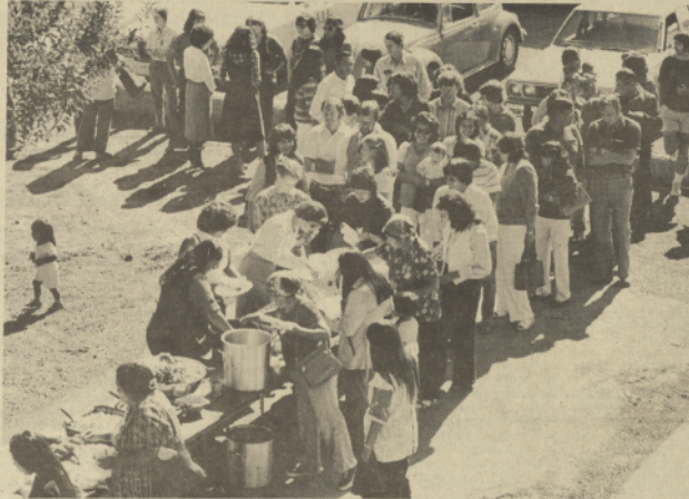
Many people gathered to celebrate the grand opening of the completely renovated alcohol center.