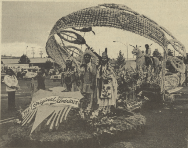
We received another blue ribbon for our efforts in the Grand Floral Parade