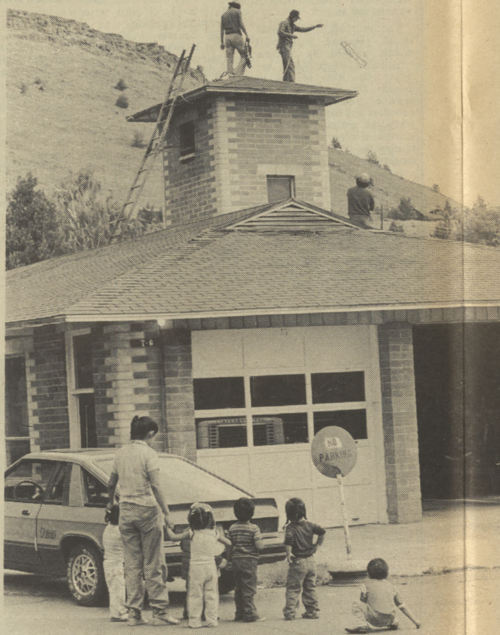
Future Firefighters—Children from the Day Care Center with Wanda Jackson on a walk, stop to watch the new fire department practice climbing off a building.