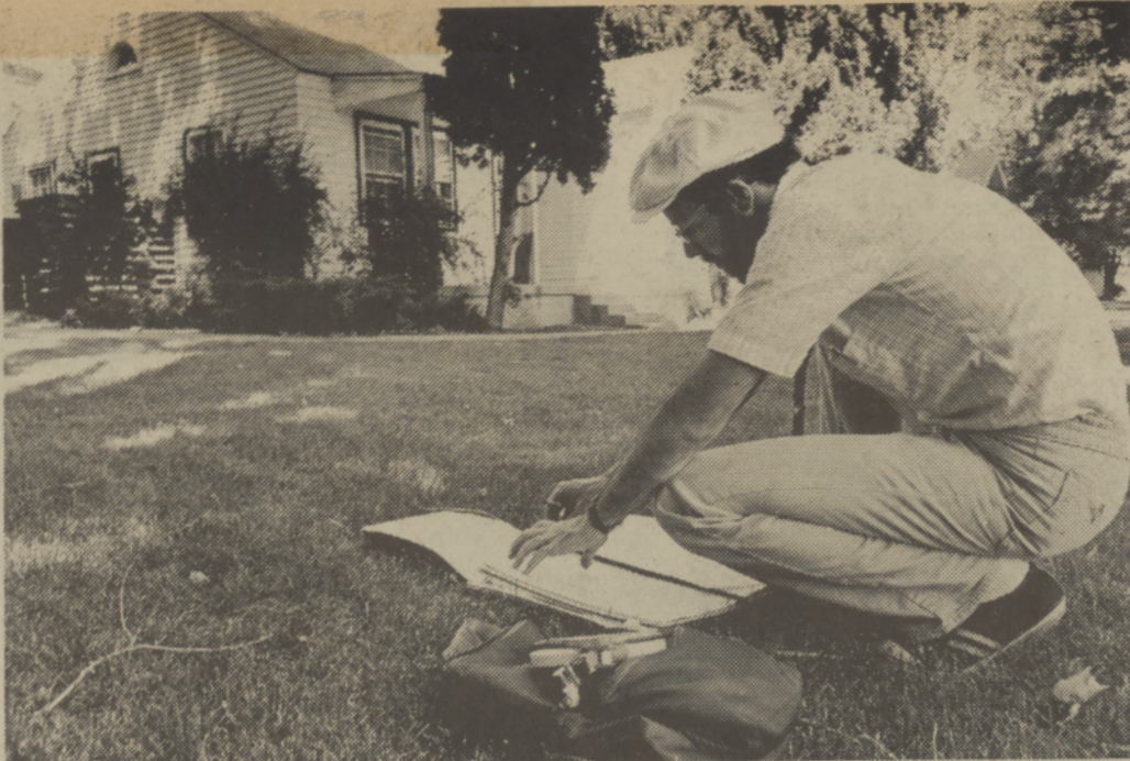
THE HOUSE THAT BIA BUILT —An architect from a Seattle firm recorded the structural details of a Bureau of Indian Affairs house as part of a nationwide survey of Bureau property. A team of architects and engineers examined buildings inside and out, noting the condition, revising floor plans and taking photographs.