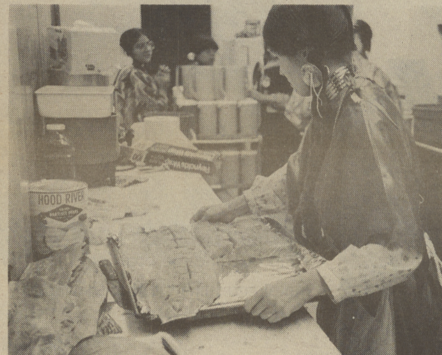
Fixing Fresh Salmon