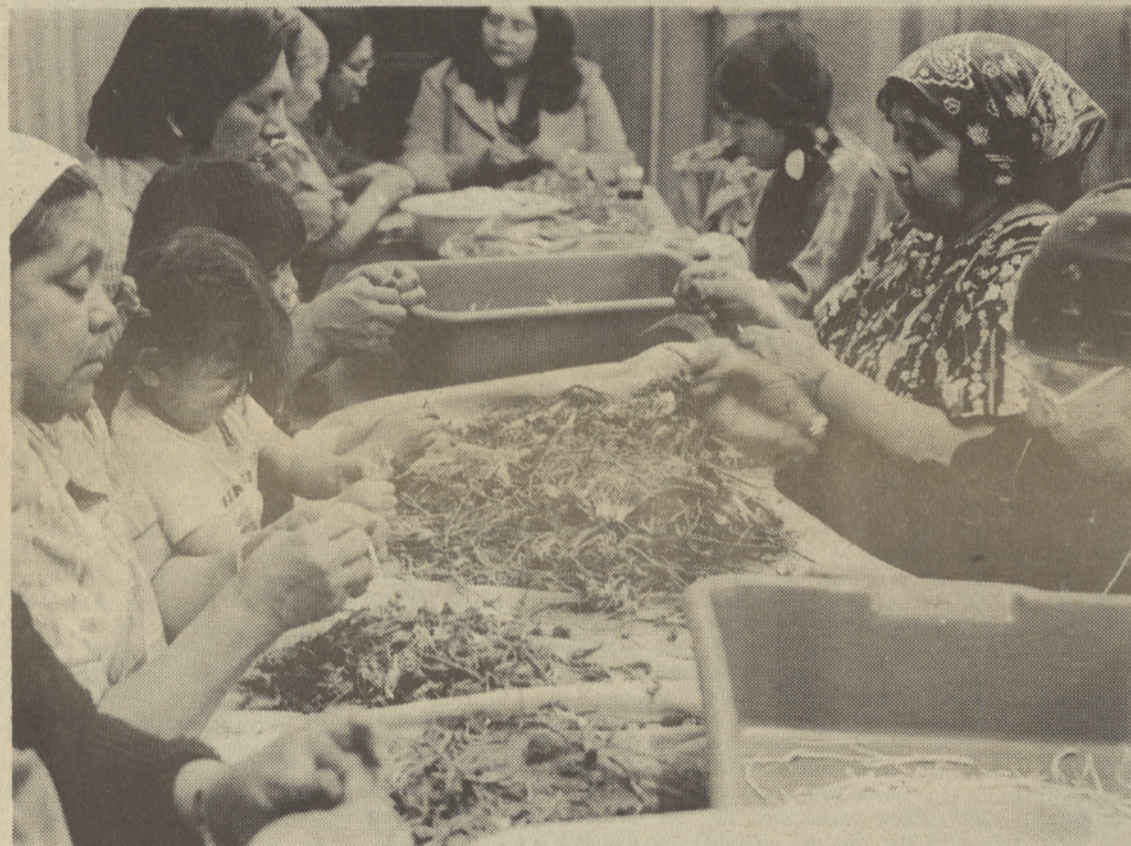
A Group Experience