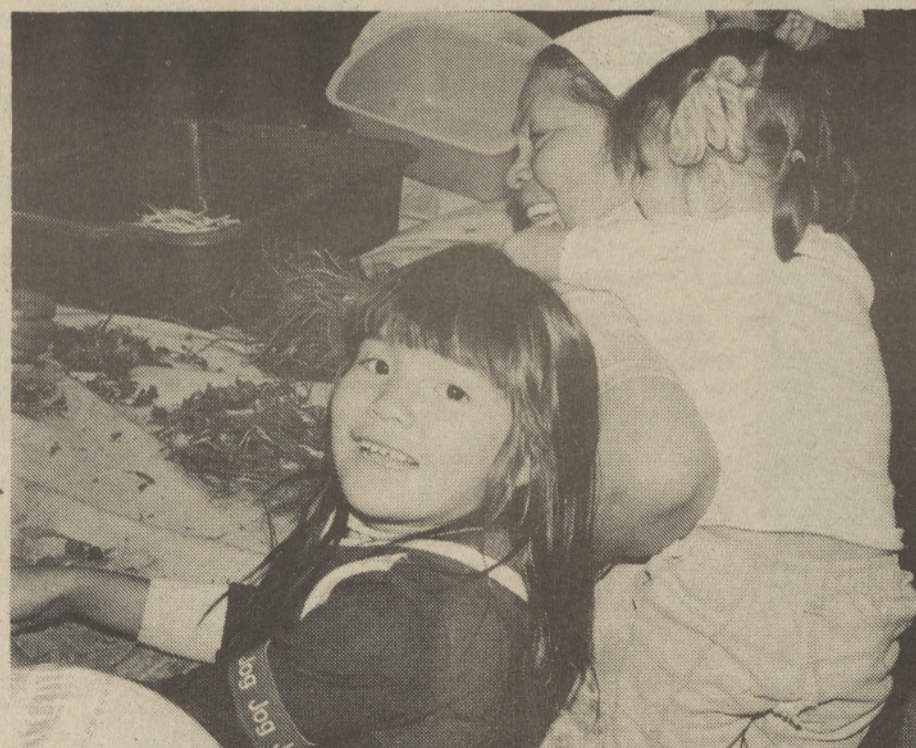
Time For Fun, Too