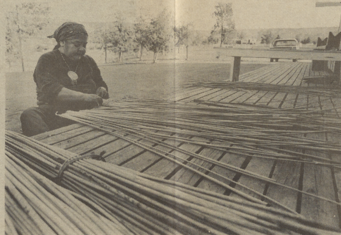
Making Tule Mats