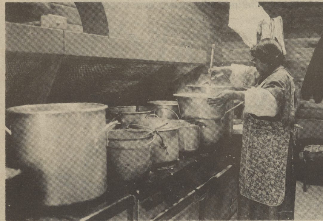
Kettles of Roots