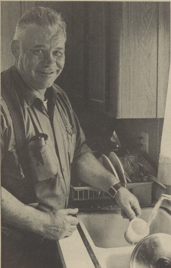
(4) Steady Flow

The coming year has more progress in store, with the expansion of the apartment complex and mobile home park and the development of subdivisions in Simnasho and at a rural location. Two major public buildings are also in the design stages — a criminal justice facility and a community learning center to house education and media services.