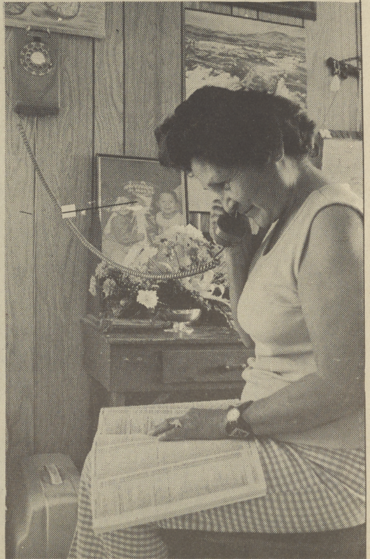
(3) In Touch