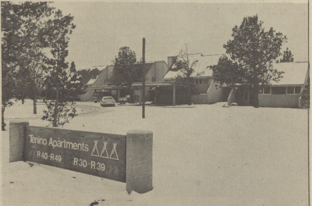
(5) Urban Vista