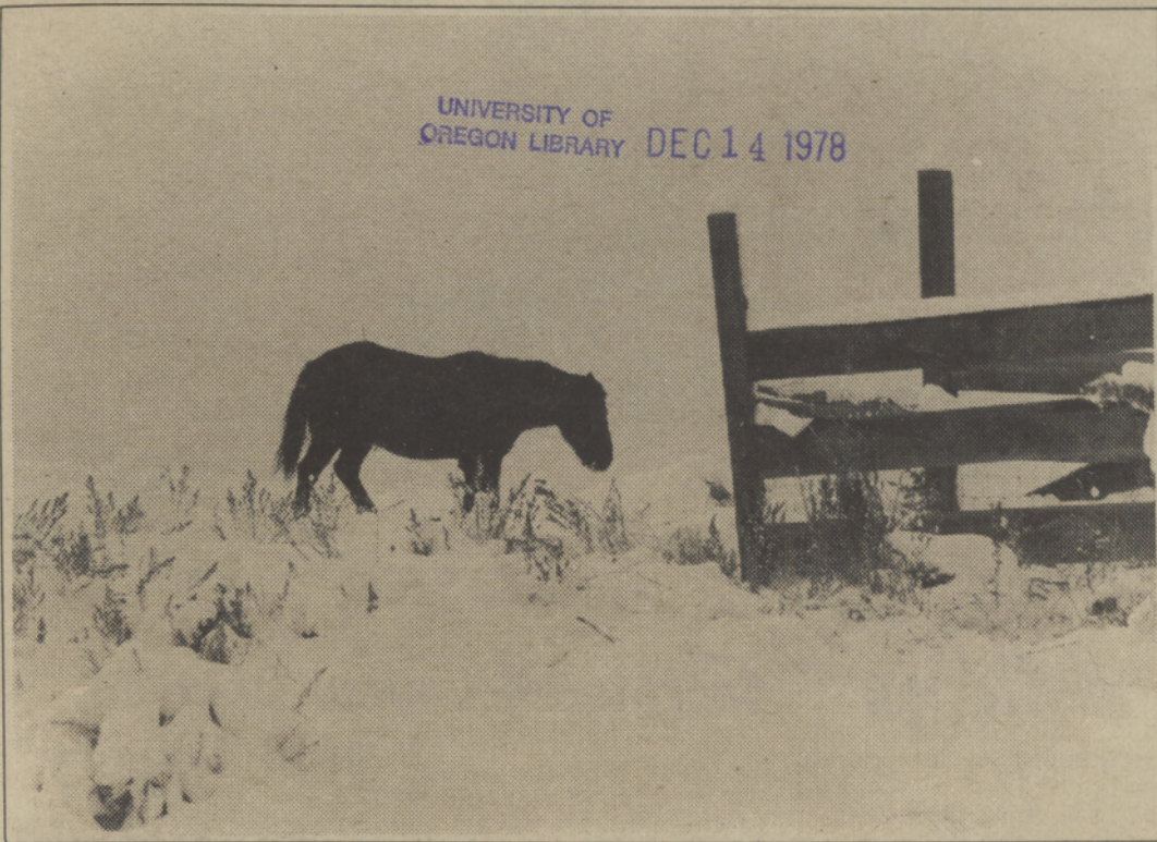
Spilyay Tymoo

UNIVERSITY OF OREGON LIBRARY DEC 14 1978