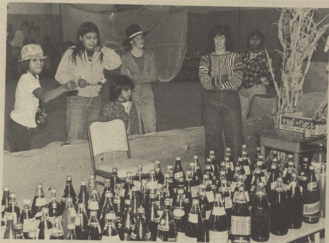
POP AND SPOOKS — Halloween night found kids at the community center carnival and costume judging after freaking out Warm Springs neighborhoods.