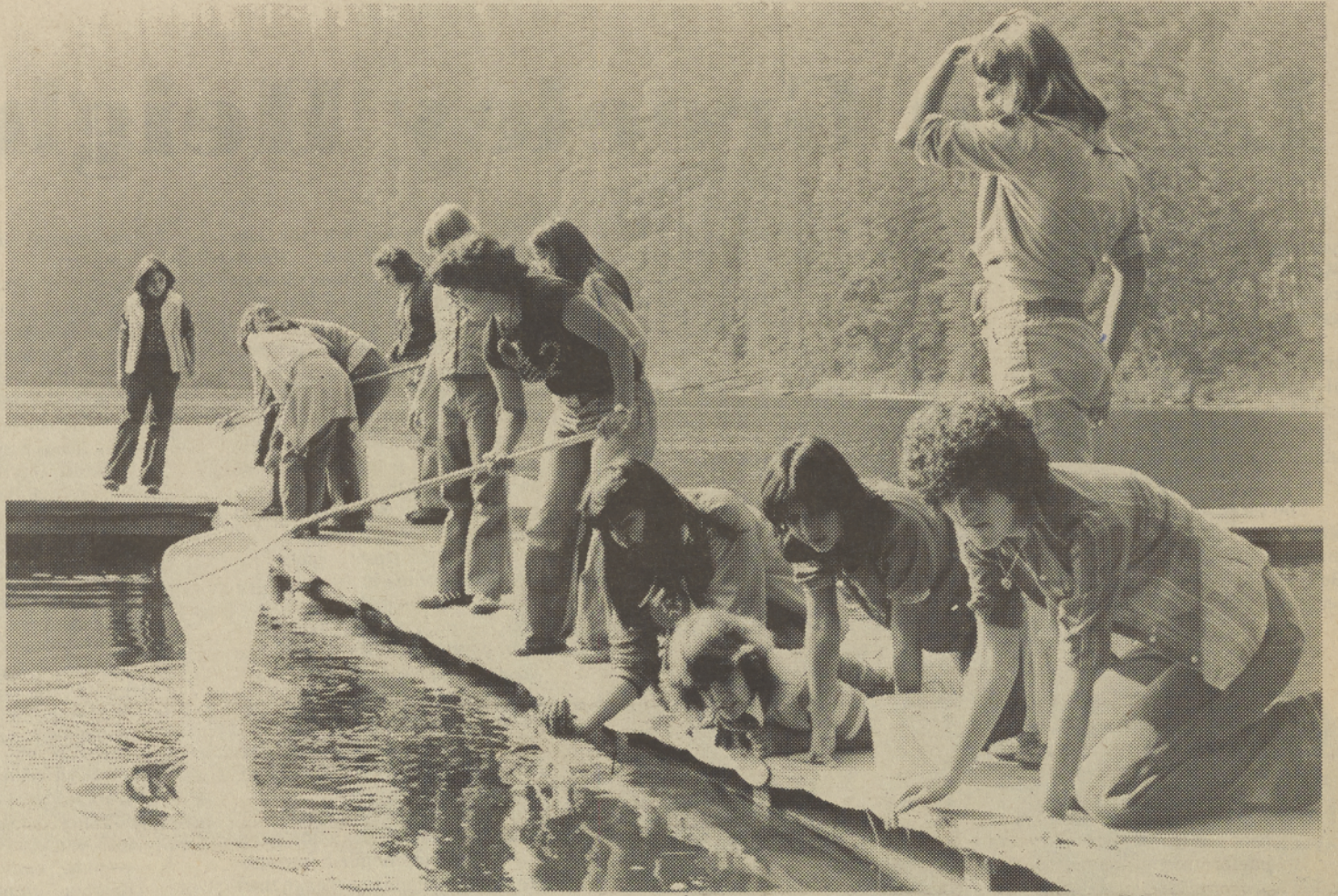
GONE FISHING - Counselors and campers probed the waters of Dark Lake at Camp Tamarack to try and catch the most aquatic life in a contest at Camp Tamarack. Weather conditions at camp were perfect at Outdoor School as each day was sunny and bright.

Just completing its tenth year, it looks like outdoor school is going to stay as long as it holds up in the budget. Other than that, Camp Tamarack reached the goal it set, to better acquaint sixth graders with each other because from Jr. High level and up they will all be attending the same school.