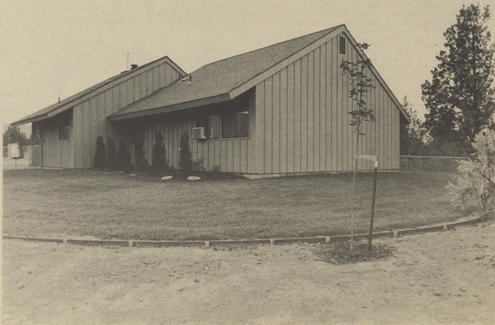
SPACIOUSNESS - Each of the homes in the Greeley Heights sub-division is situated on approximately 1.6 acres, which gives the feeling of being in wide open spaces. With no zoning restrictions, families are able to have an animal or two on their property.

Most tenants have accumulated large stacks of fire wood, no doubt in anticipation of a long, cold winter. And even now, as evening comes over Greeley Heights, smoke can be seen rising from the chimneys and a special glow shines through the windows.