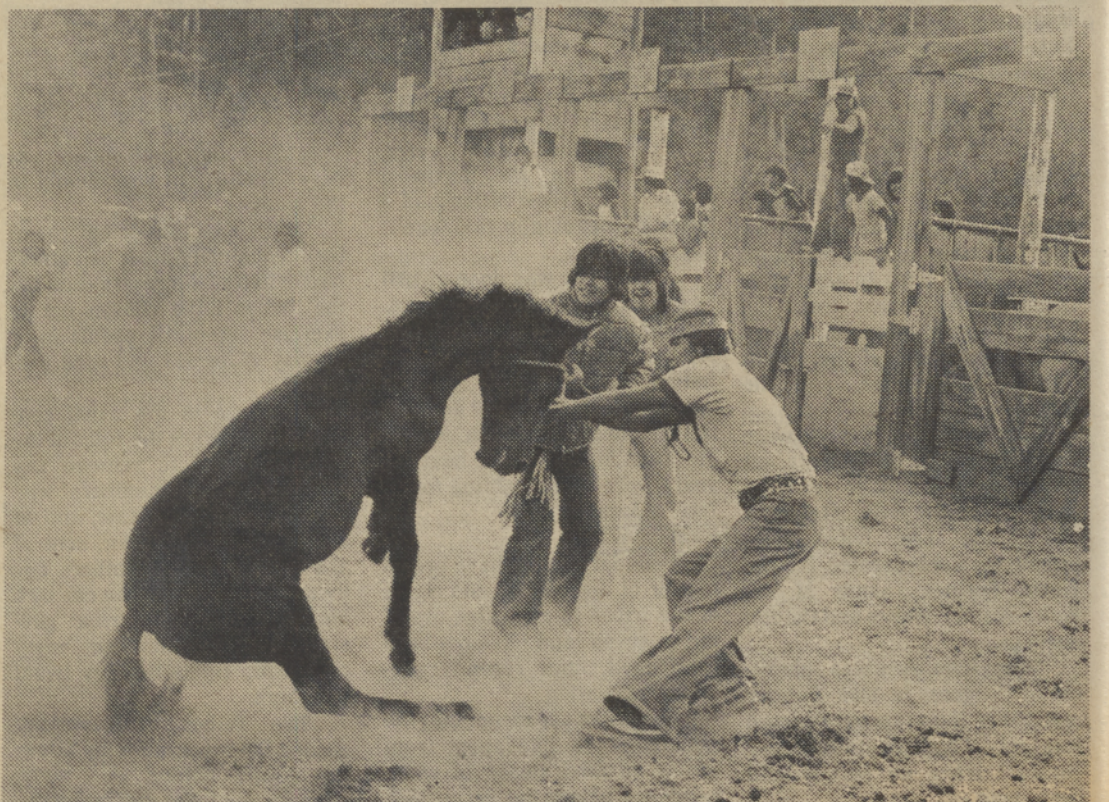
THE KIDS WILD COLT RACE DURING THE HUCKLEBERRY REAST AT HE HE MILL.

Everyone who participated in this year's arena fun day enjoyed themselves and also provided a chuckle or two for the spectators for their unorthodox methods and style in various events.