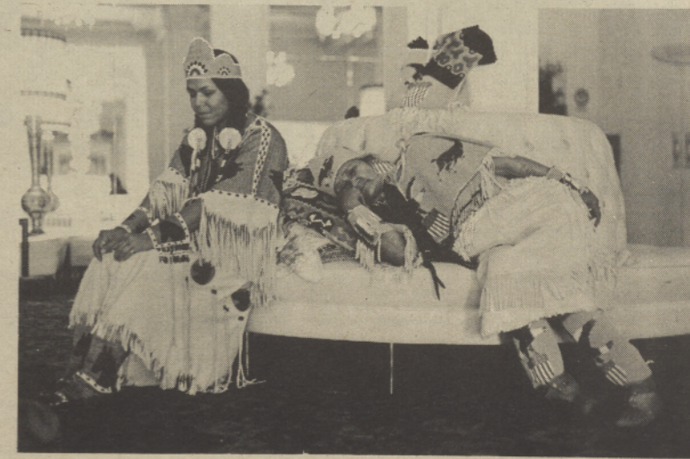
Did you call that cab?