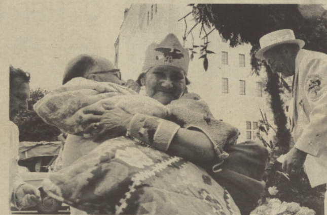
Now the fun starts

The tow truck became part of the procession when the "Three Warriors" lost its power.