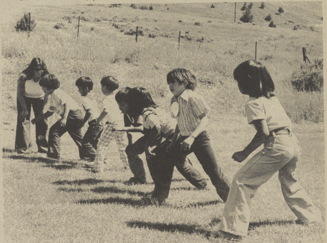
Warm Springs Grade School students got a running start on summer vacation June 2 during "Playday", which is traditionally held on the last day of school. In addition to the many games, the grade school furnished picnic lunches for the kids and their parents.